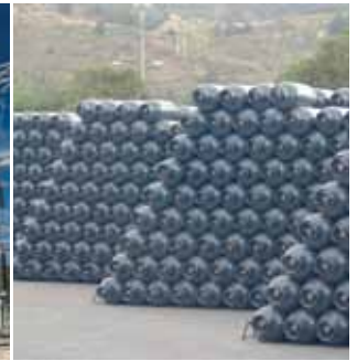
Coal, offshore hydrocarbons, electricity and gas — Colombia has an abundance of energy sources, and there's plenty of opportunity for additional investment.