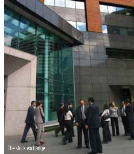
The stock exchange

Daily trading volume is running at an average of US$150 million, but a number of local IPOs are starting to shake things up. The Davivienda bank raised US$228 million last October in a Bogotá offer that was oversubscribed 13 times. It was the country's first IPO since 2007. Avianca (via its owner Avianca-Taca) followed suit in March of this year, raising around US$250 million. And the state-run Ecopetrol said it planned to offer some 1.67 percent of its capital for around US$1.4 billion.