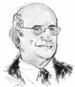
3 Grupo Aval Luis Carlos Sarmiento Angulo