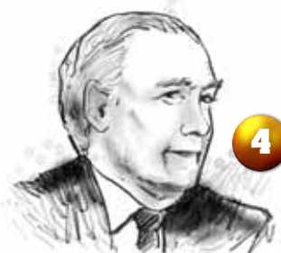
4 Grupo Santo Domingo Julio Mario Santo Domingo

respectively the country's second-, fifth-, seventh- and 14th-largest banks. The man behind Aval is Luis Carlos Sarmiento Angulo, last year listed by Forbes magazine as the world's 135th-richest man. Sarmiento started in residential and commercial construction and is frequently described as a prudent, conservative manager. "I get to the office at nine in the morning and work till nine at night, but on Saturdays I don't even answer the phone. I use that time for reading," Sarmiento said.